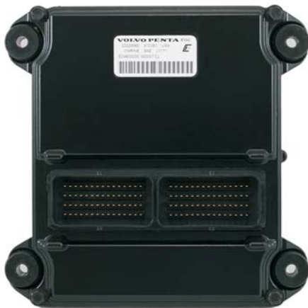
Fig 1. Volvo Penta DI Engine Control Module

A major benefit of direct injection is that it allows very precise fuel delivery timing. The injectors typically deliver fuel into the combustion chamber after the exhaust valve has closed (to avoid raw fuel spraying out the exhaust port) and before the spark plug fires. This window of time represents just over 300 degrees of crankshaft rotation. By contrast, injectors on PFI engines could flow fuel for almost the entire 720 degree rotation of the crankshaft. The narrower fuel delivery timing window on DI engines requires very high pressures to inject fuel quickly and also to overcome cylinder pressure. In some situations, such as cold starting, the DI injectors may open and close multiple times during one combustion cycle to deliver an adequate fuel charge.