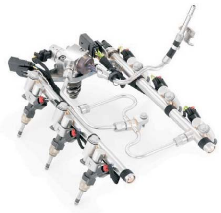
Fig 2. DI Pump and Fuel Rail Assembly

Software updates for Rinda Technologies service tools related to diagnosing and servicing DI engines are available. Please contact us for details or visit our website at www.rinda.com .