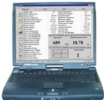
DIACOM® Marine Version 2.9

Important Information for Marine Service Technicians