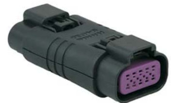
#94032 6-pin to 10-pin CAN converter

For additional information please contact Rinda Technologies at (773) 736-6633.