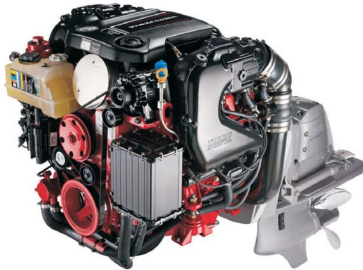
Volvo Penta's 4.3L Direct Injected V6-240