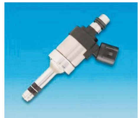
Delphi Multec Direct Fuel Injector

on the new DI engines. First and foremost is the increase in fuel rail pressure. While typical PFI engines had fuel rail pressures in the 40 to 60 psi range, direct injected engines can have pressures of 2200 psi or