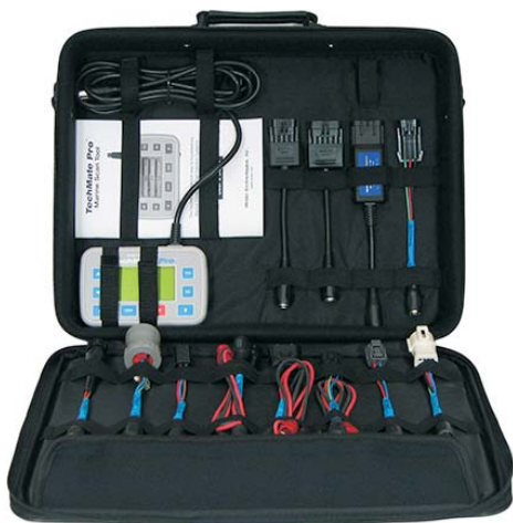
TechMate Pro deluxe kit with carrying case and adapters

The TechMate Pro has the widest marine engine support in the industry. Covering over two decades of marine EFI engines the tool displays complete engine control system information, faults and provides a variety of engine test and configuration features. TechMate Pro is the professional's choice for marine service.